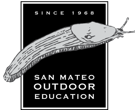
PHOTO RELEASE FOR STUDENT PARTICIPATION IN OUTDOOR EDUCATION VISUAL PRESENTATIONS

San Mateo Outdoor Education, a program of the San Mateo County Office of Education, develops presentations designed to inform students, parents, and school personnel about the Outdoor Education Program. Your student may be photographed and recorded as part of preparing the visual presentation. The visual and/or recorded presentation may be in the form of a video program, printed promotional materials, or Web page on the Internet. As part of the Outdoor Education experience, Naturalists, Cabin Leaders, and Students photograph their week at Outdoor Education. The pictures are compiled into a culminating slide show that is shown on Friday morning to all the students. A CD of the pictures is given to each school. We can make no remuneration for participating in this project. Your consent to your student's participation is required, as is this Release, Hold Harmless, and Indemnification Form. If you wish to allow your student to participate, please sign below